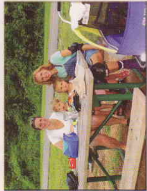
Enjoying a picnic along the trail.