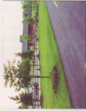
One of the four trailheads.