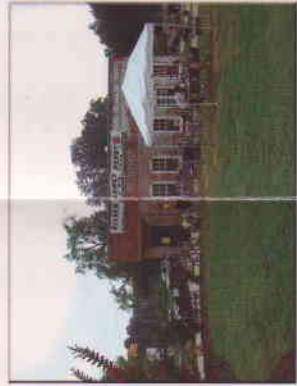
Bicycles for rent at Silver Comet Depot.