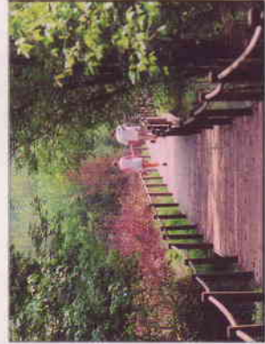
Heritage Park Trail connects to Silver Comet.