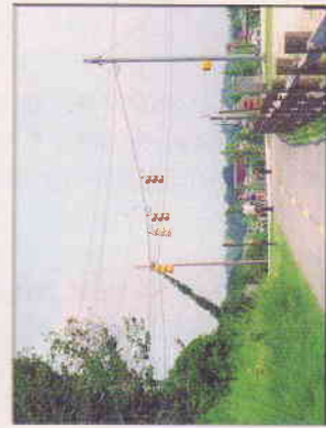
Silver Comet/Florence Rd. intersection.